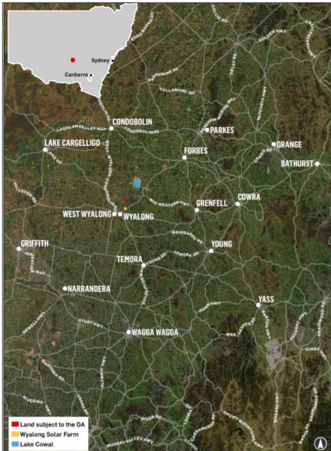
Figure 1 | Regional Context

Lightsource Development Services Australia Pty Ltd (Lightsource BP) has approval to develop the West Wyalong Solar Farm (the project). The project is located approximately 16 kilometres (km) northeast of West Wyalong in the Bland Shire local government area (LGA) (see Figure 1 ).