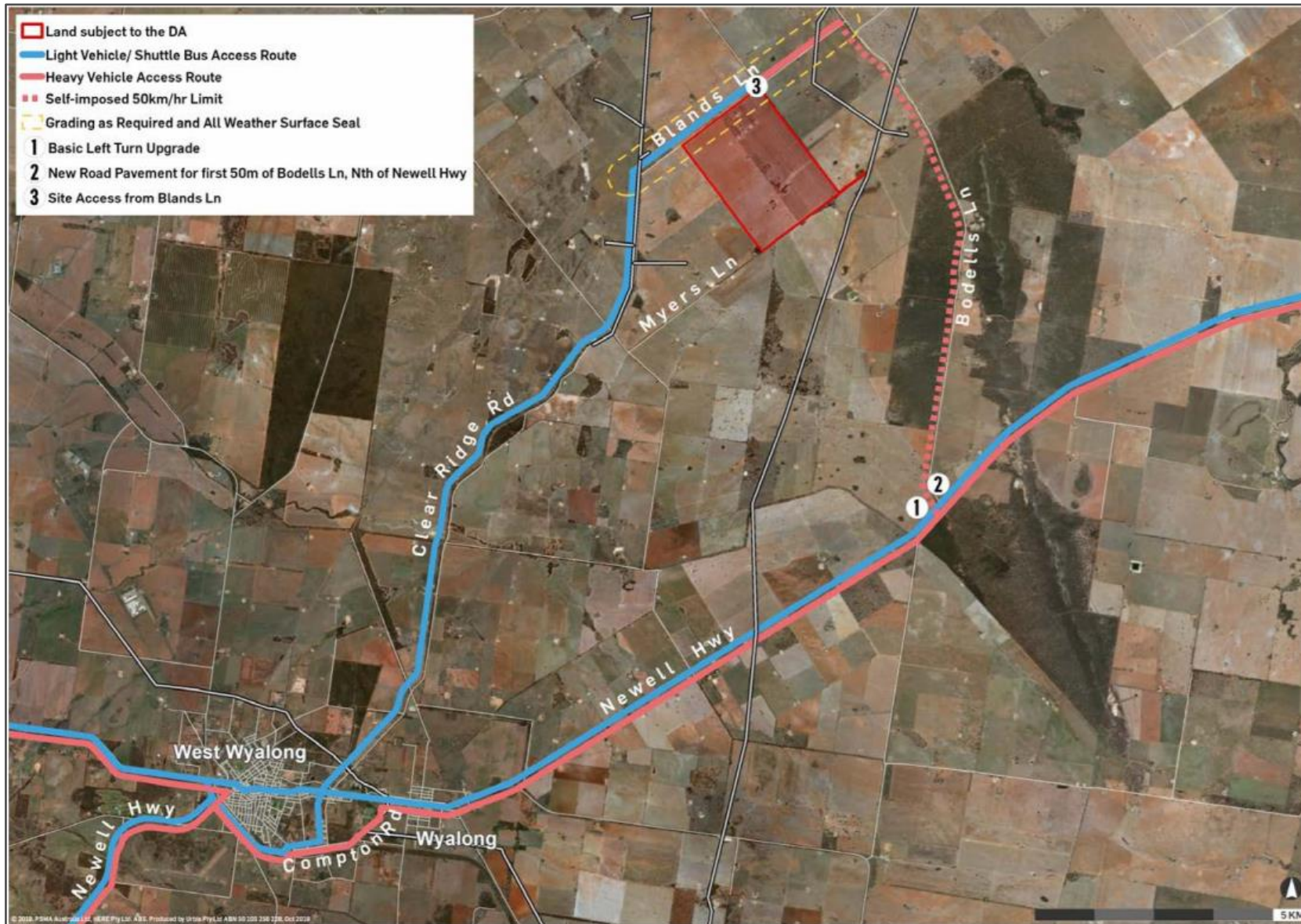
Figure 2 | Approved road upgrades and site access