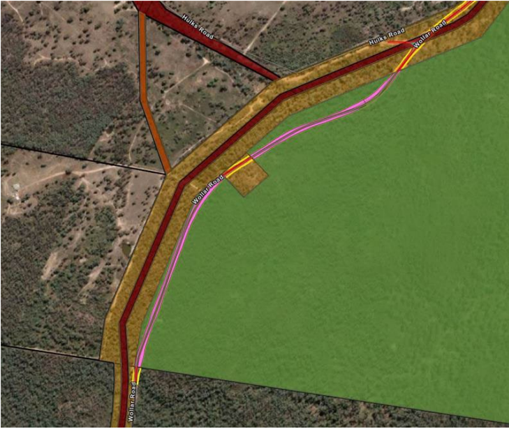
Figure 1 Area of Wollara Road which is outside of the cadastral road reserve boundary, and which falls in State Forest (shown in pink) or Crown Land (yellow)

These proposed amendments will assist Lightsource bp to efficiently deliver the Project, contribute green electrons to the national energy market in a timely manner and achieve committed milestones under the LTESA.